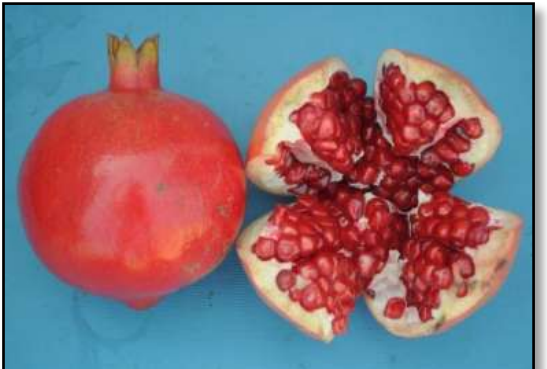
Figure no. 2: The mature fruit of the pomegranate[5]